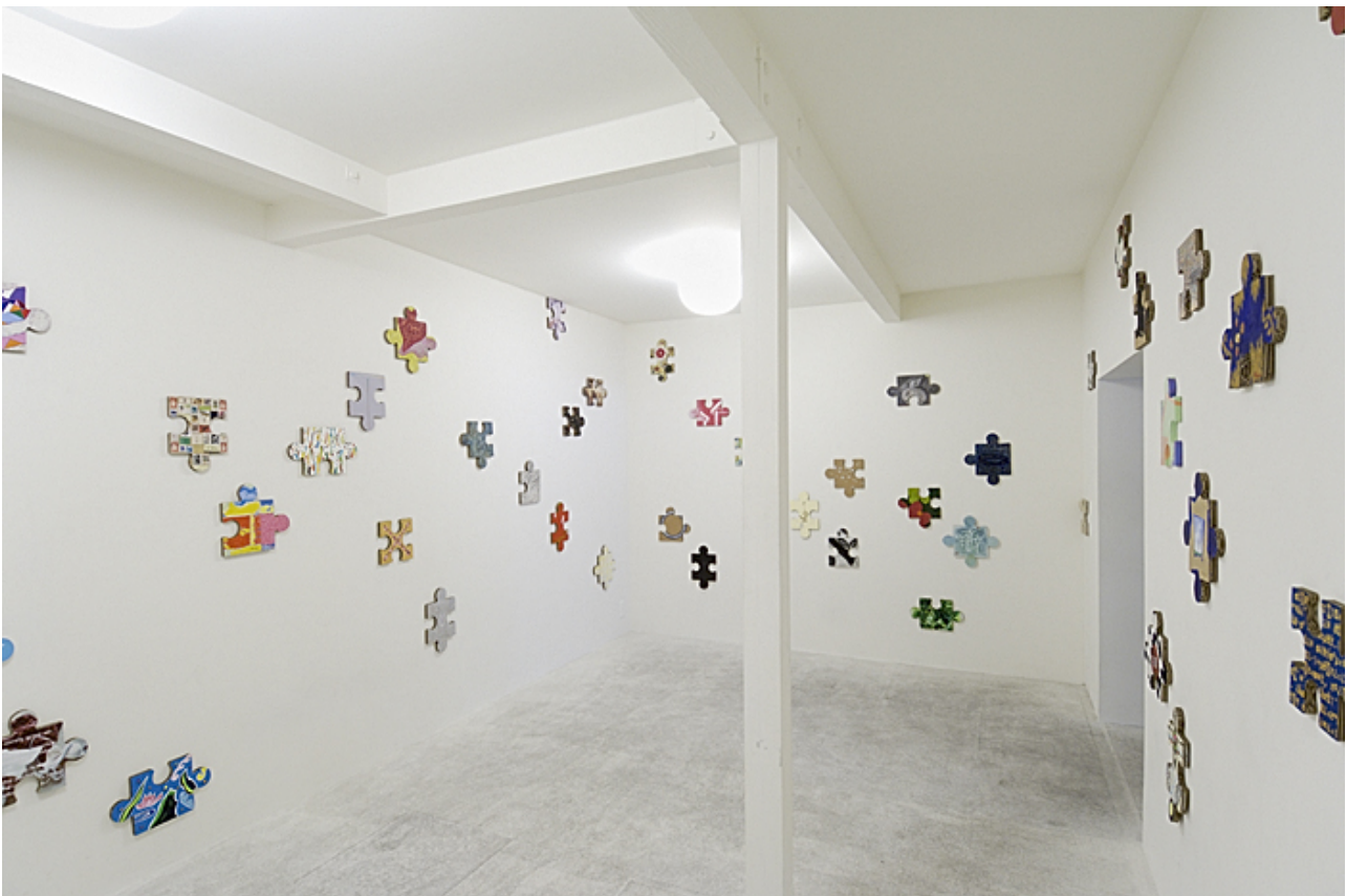
installation view at chef doevre, 2006