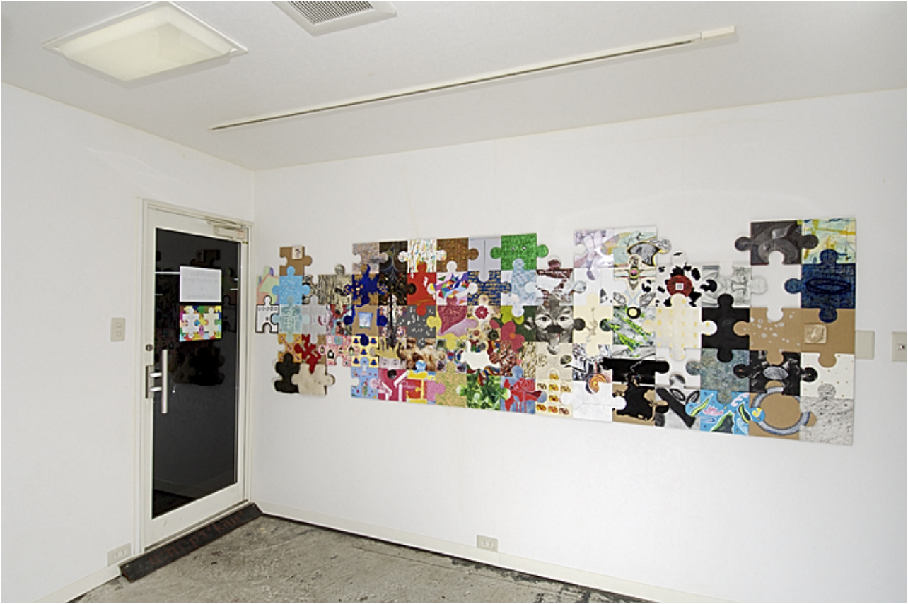
installation view at u:ni:pon2kau2 art project space, 2006